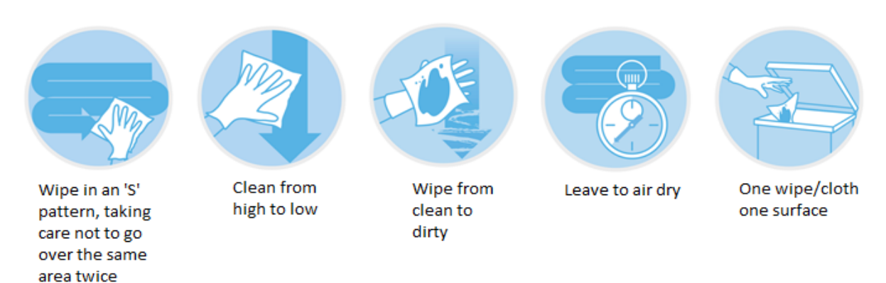
Figure 1Tips for cleaning

Cleaning is to be completed in a methodical way to prevent cross contamination of surfaces. When cleaning, it is important to clean from high to low, from clean to dirty and wipe in an 'S' shape pattern. Use of a damp dusting technique prevents dust particle dispersion when dusting surfaces (Figure 1).