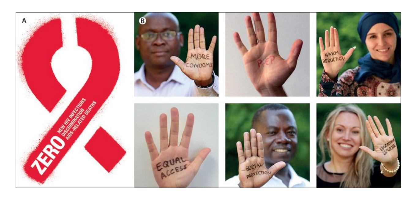
World Aids Day 2016 Hands up for HIV prevention (global messaging)