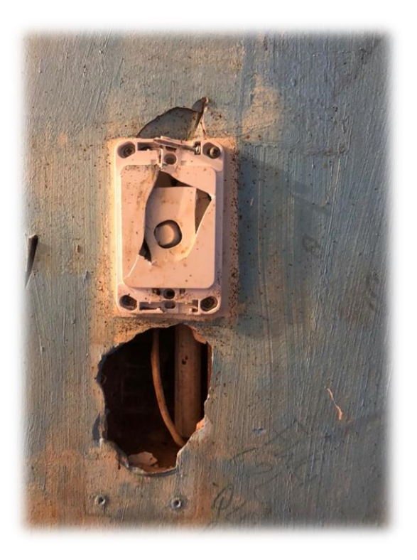
What is the chance of hot water in the house below?

Is the condition of the light switch in the following photo dangerous? Whom do you inform? How soon will it be fixed? The obvious answer is it's very dangerous and is a priority. This is not unusual as AEH practitioners are confronted with similar experiences from time to time. Housing has informed us that they are very keen that any instances of poorly maintained housing are reported on its telephone Hotline. Further information on how to do this available from EHD.