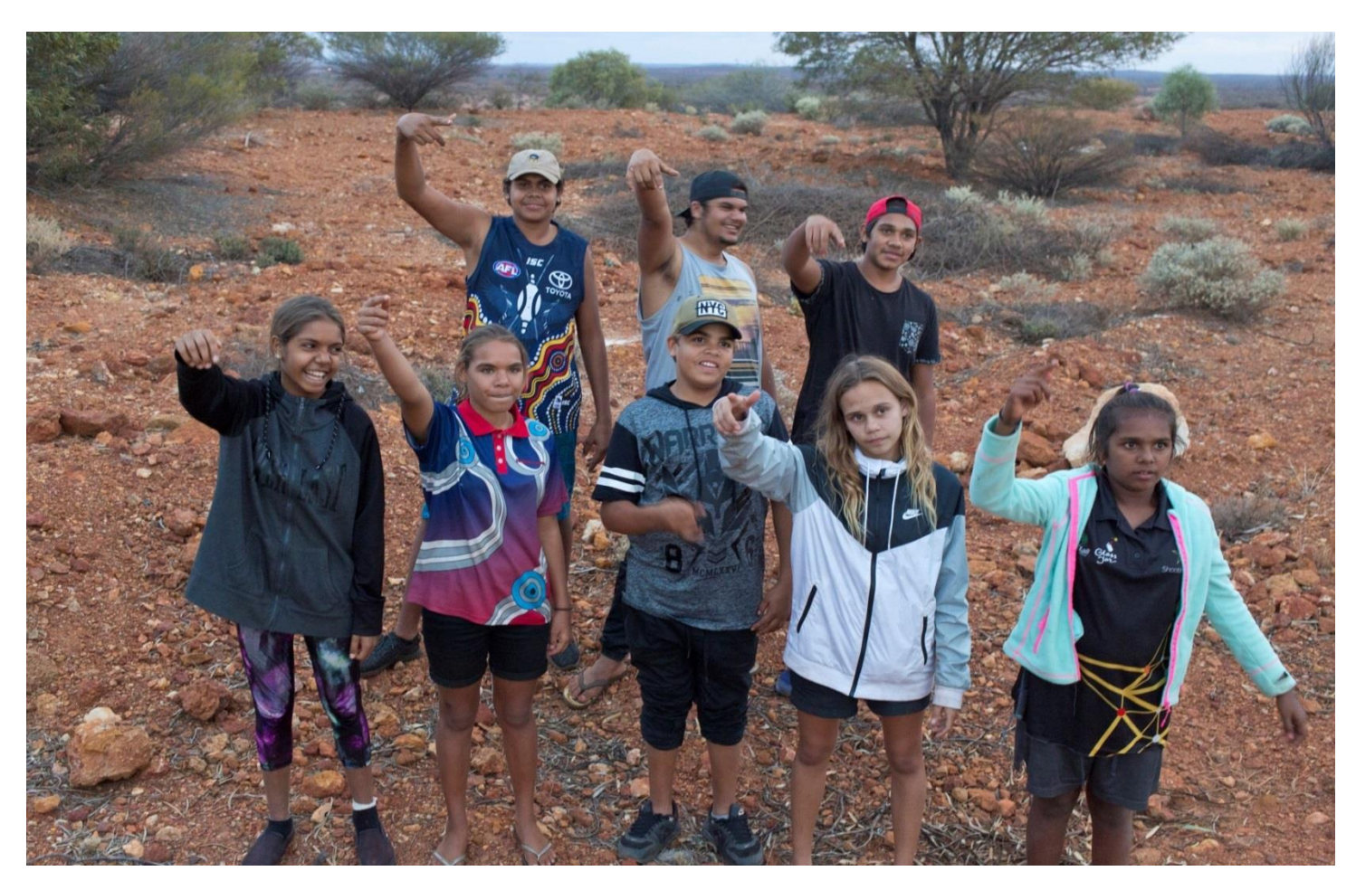
Healthier country communities through partnerships and innovation Values Community | Compassion | Quality | Integrity | Justice