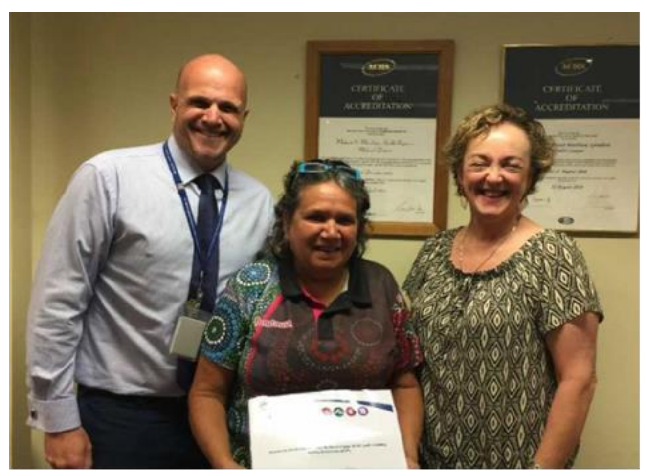
Healthier country communities through partnerships and innovation Values Community | Compassion | Quality | Integrity | Justice