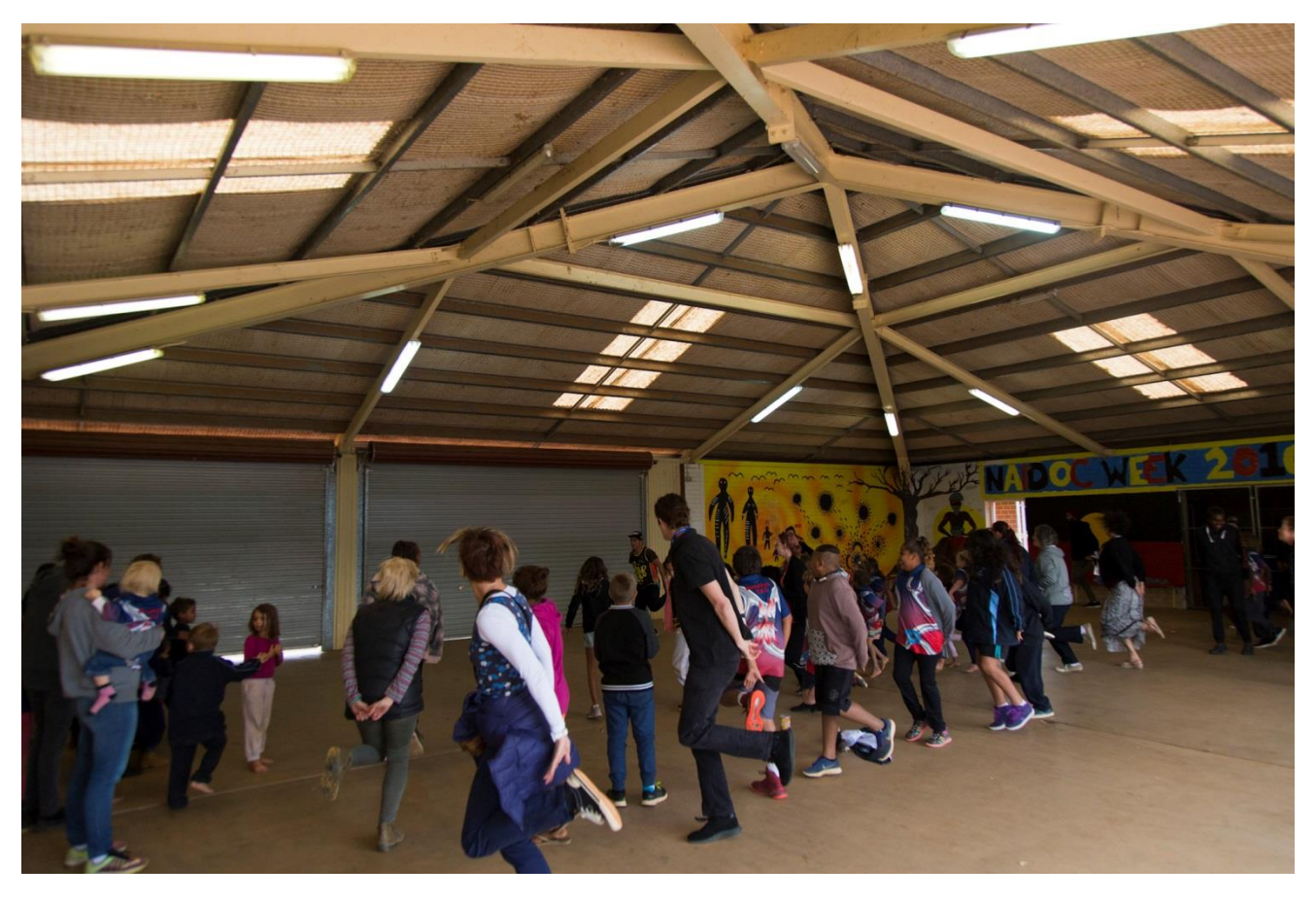
Healthier country communities through partnerships and innovation Values Community | Compassion | Quality | Integrity | Justice