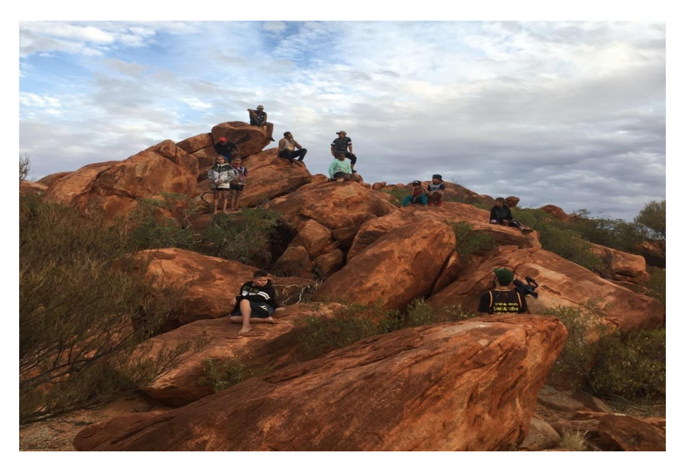
Healthier country communities through partnerships and innovation Values Community | Compassion | Quality | Integrity | Justice