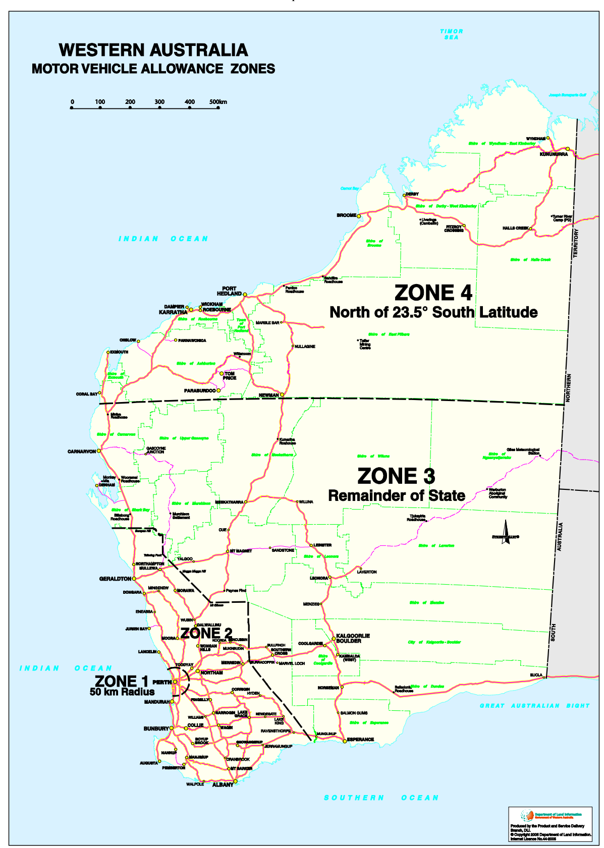
Part 4 – Motor Vehicle Allowance Zone Maps