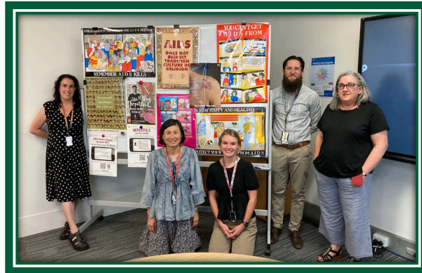
16 November: 'Harm Reduction for STIs and Blood Borne Viruses'