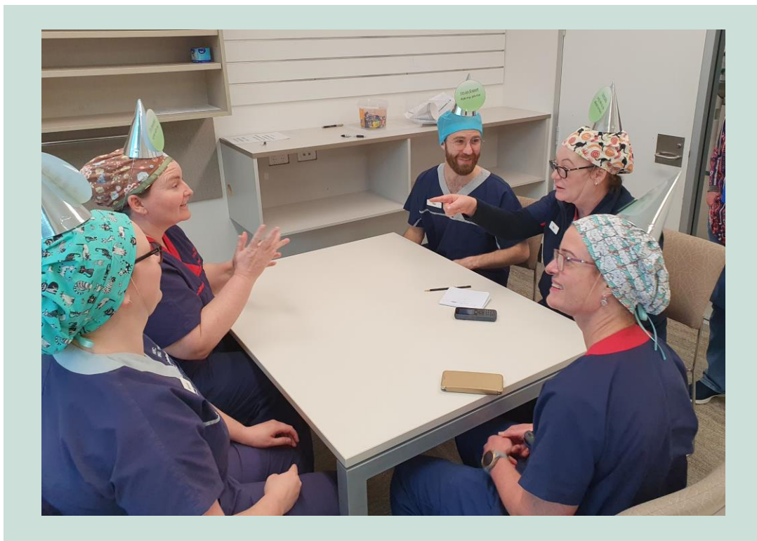
Communicating for safety headbands exercise

Ongoing work continues to be done to build multidisciplinary collaboration for patient safety.