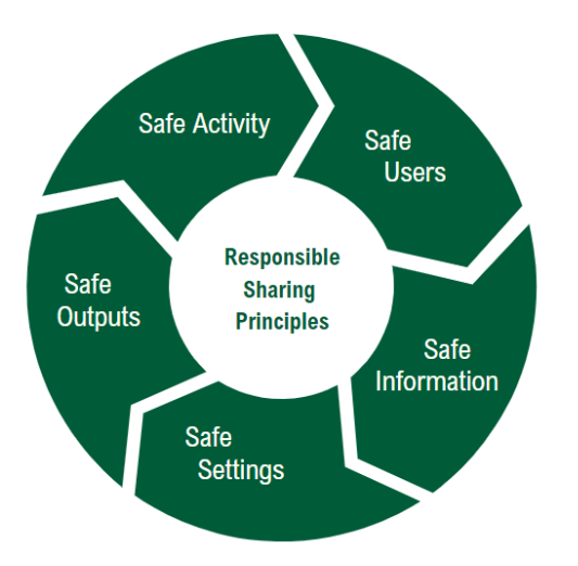
Figure 3: Responsible Sharing Principles

Source: Modified from Privacy and Responsible Information Sharing for the Western Australian public sector: Discussion paper