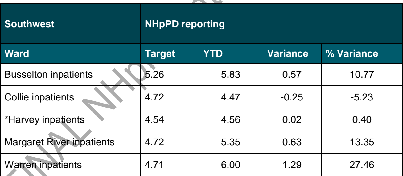
Table 28: WACHS – Southwest

In addition to the 15 stated IDHS described within the WA Health CSF 2014-2024